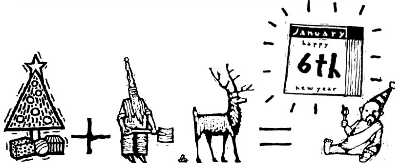
from the New Moon Journal online at http://www.newmoonjournal.com

One day = one month, 12 days = 1 year The 12 days of Christmas represents a time to reflect and review the past year.